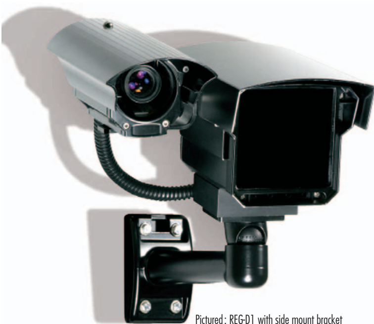
Pictured: REG-D1 with side mount bracket